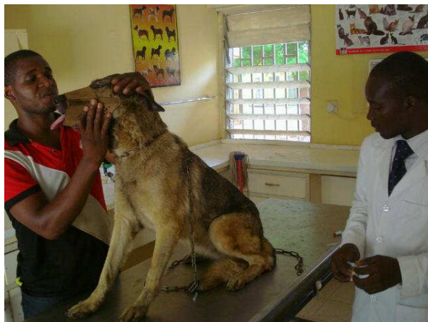
A dog presented for vaccination during the free vaccination campaign