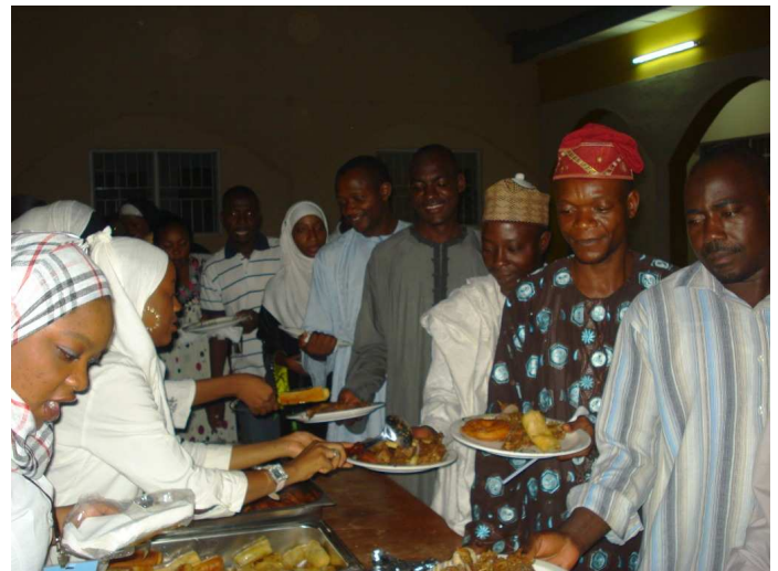
Cross section of guest during the Cocktail Party