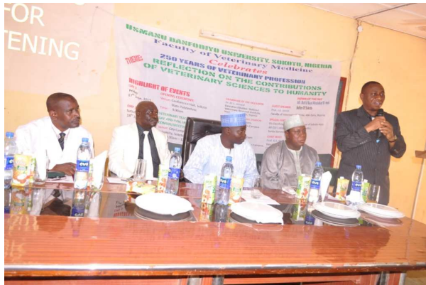
High table during the Veterinary Teaching Hospital Open day