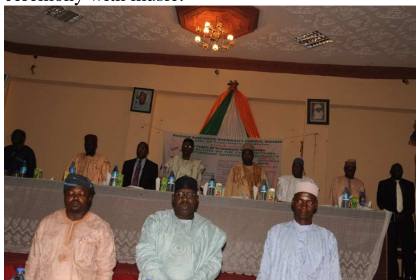
Awardees during the opening ceremony, behind them are members of the high table