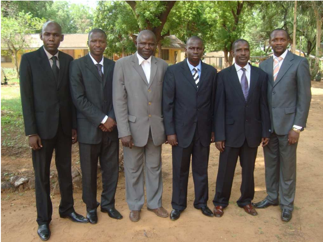
Steering Committee Members

We appreciate the International Committee for the support and encouragement we received before and during the celebration.